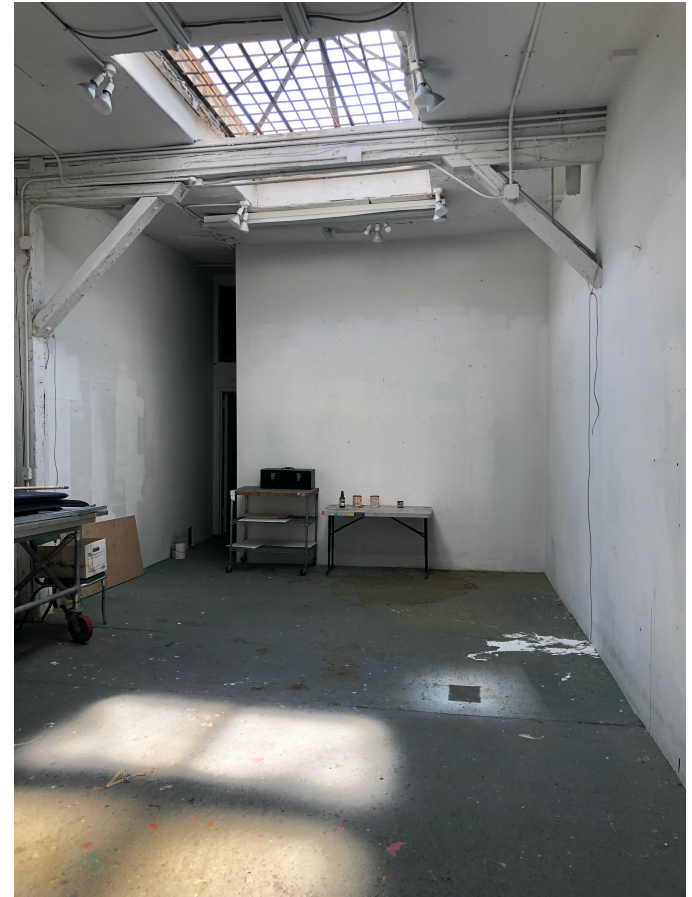
Interior Existing Conditions